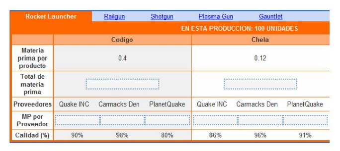
Figure 8, Actual View of the Game WebApp (2)